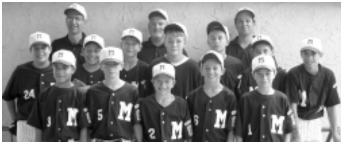
12/11 YEAR OLD TOURNAMENT TEAM

The 12/11 year old District 19 team finished the Little League Tournament with a 2-2 record, defeating Drexel Hill 1-0, losing to Aston-Middletown 7-1, defeating Leedom 12-7 and losing to Upper Darby 5-1.