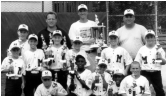
10/9 YEAR OLD TOURNAMENT TEAM

The 10/9 year old District 19 team completed a successful campaign in 2002 by winning their way to the final four in the District 19 tournament. The team finished the tournament with a 3-2 record, defeating Drexel Hill 2-1, defeating Darby 10-1, losing to Aston-Middletown 9-6, defeating Del Val 11-1 and losing to Newtown-Edgemont 6-5.