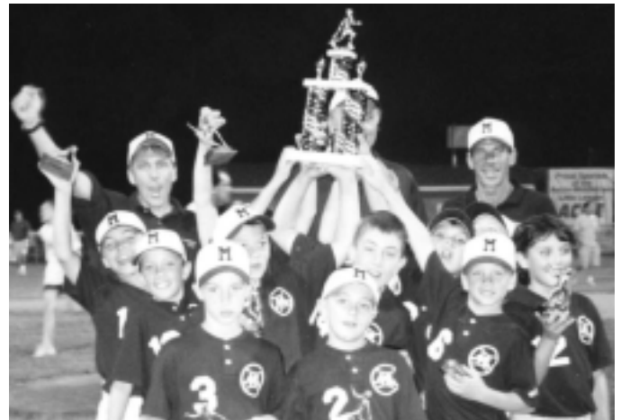
9 YEAR OLD POST SEASON TEAM

Media's 9 year old team's success in the Aston-Middletown tournament and over the course of the post season was a great experience for the players, coaches and parents. Perhaps more important for the kids was experiencing first hand, the satisfaction and sense of accomplishment that comes from hard work (practice), teamwork and determination.