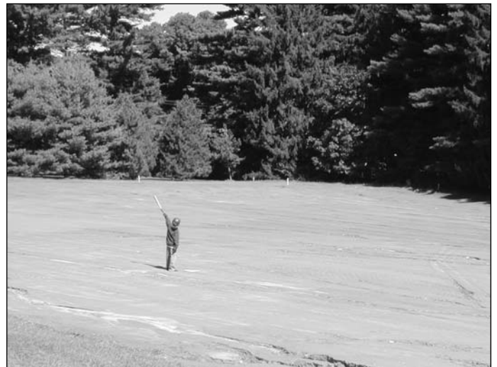
Future Bambino dreams of long ball

Shortly after the end of the 2004 season, the ground was finally broken to begin building the latest addition to the Media Little League Complex. Scheduled for completion in time for the 2005 season, the new baseball field will be officially dedicated on April 16 th during the Opening Day Ceremonies. This new field, which will help ease the burden on the existing fields and increase the number of practice and game days for our players, would not have been possible without the strong support and generosity of our Media Little League families and the community at large. We hope everyone comes out on Opening Day and shares in the special moment when our new field receives its’ name and becomes the new stage for all of the future memories it will certainly generate. As any adult who has returned to the place where they first learned the game understands, there’s an indescribable feeling of standing on home plate and traveling back in your mind to a simpler time when you played Little League baseball. And so now new stories will be written to be told by future parents to their children and our collective Field of Dreams will live on.