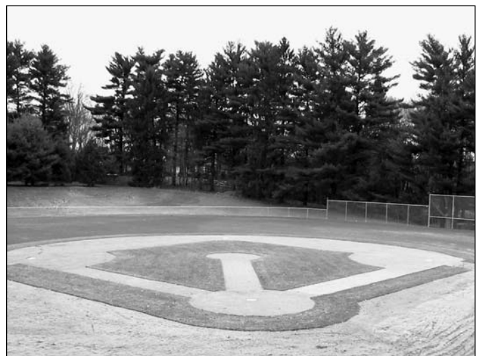
The new field takes its shape