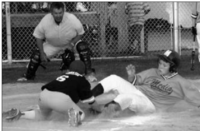
Major League Slide