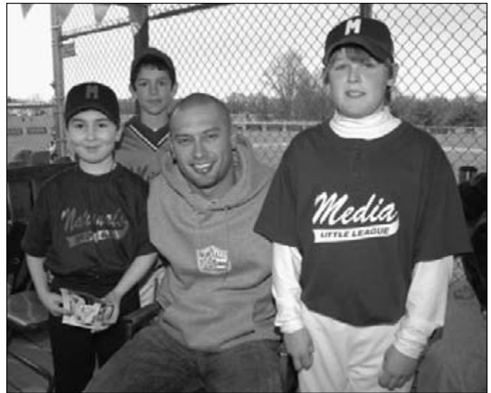
Shane Victorino joins MLL players on Opening Day

But how by the end of this century will things have changed? Will grandparents who live in another state log on to the webcam helmets of their grandchildren to get an "inside" view of the game? Will gloves or other equipment undergo any design or material changes? Will robots come out and dry the fields after a rain stoppage? Who knows? But this we do know -we hope it goes on forever and continues to bring families and communities together to have fun and create many more memories to share with one another.