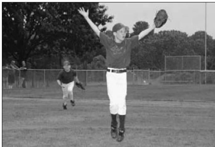
On Top of the World