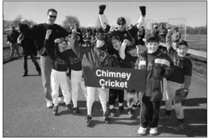
Opening Day Celebration!